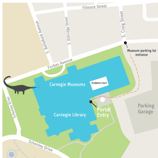
Map to parking lot entrance and Portal Entry